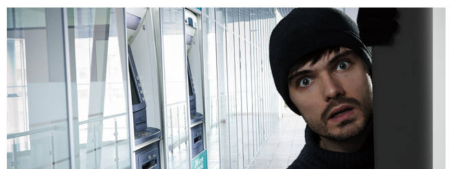
With WDR Pro