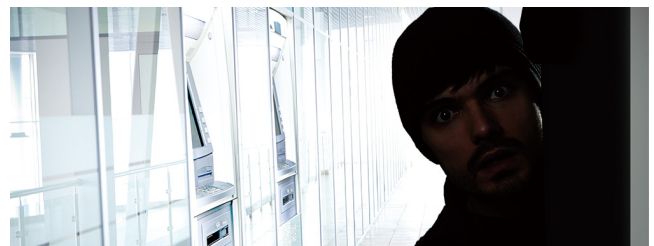
Without WDR Pro